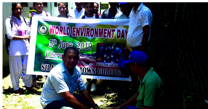
Observation of World Environment Day