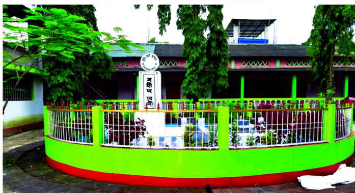
Martyrs corner of Silapathar Town College