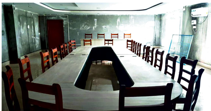
Digital Conference Hall