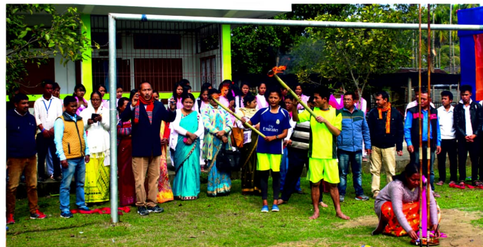
Inauguration of Annual College Week