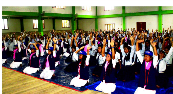
Celebration of World Yoga Day